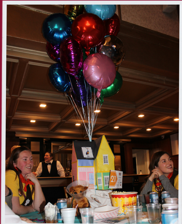
Best Table Decor 2023

Awards will be presented to the "Best Dressed" team and the team with "Best Table Decor," so gather your friends, pick a theme, and get creative!