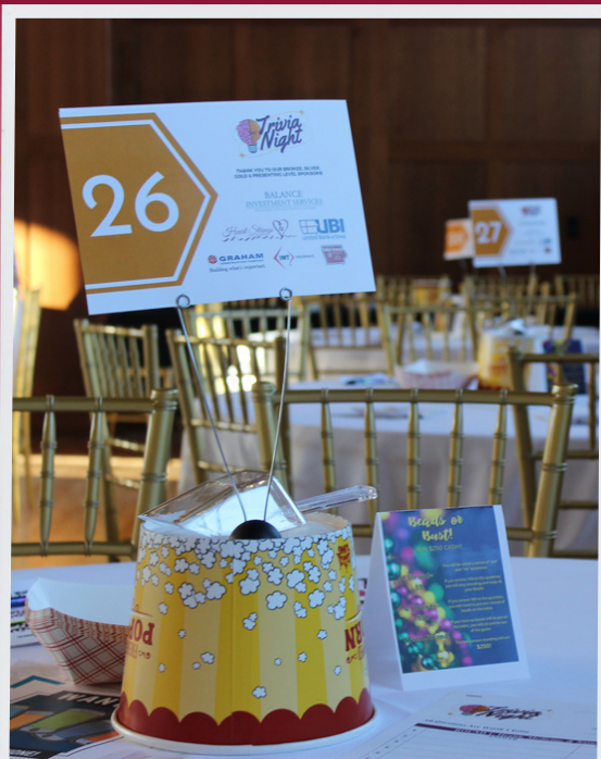
Trivia Night 2023